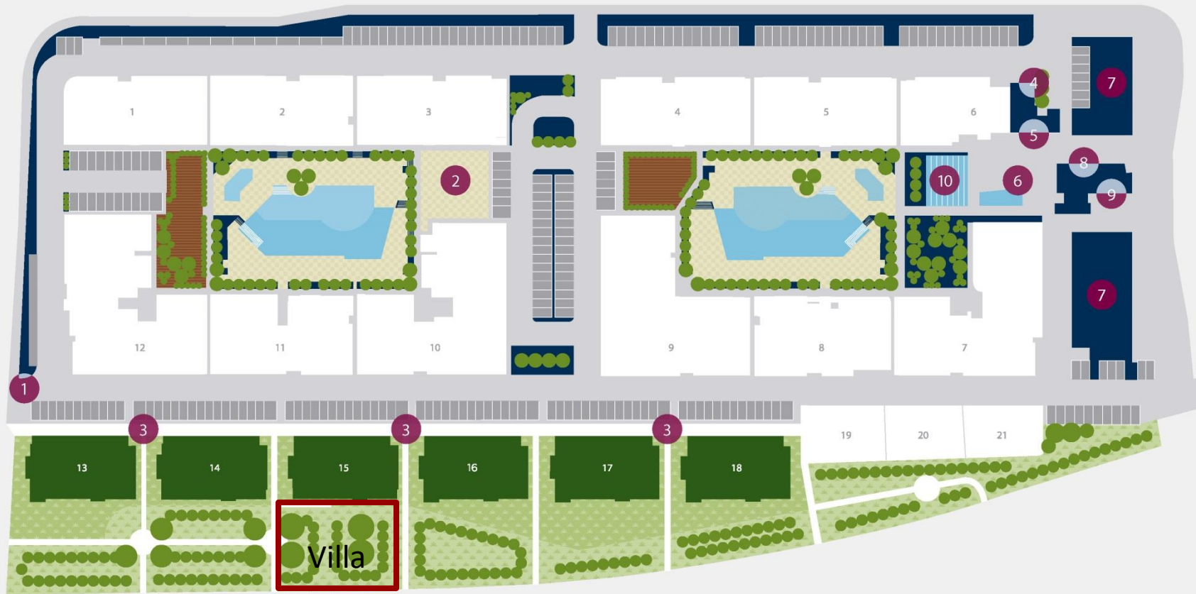
Elysia Park site plan